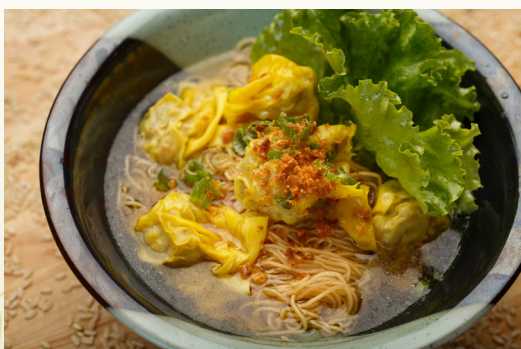
WONTON EGG NOODLE