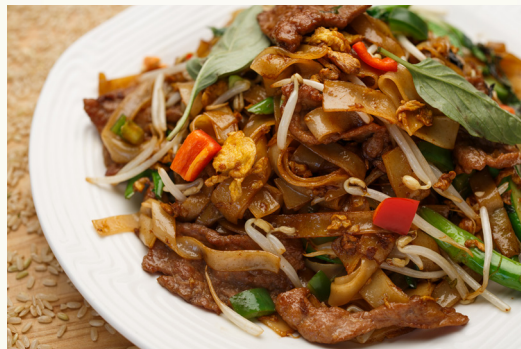
THAI STYLE CHOW FUN