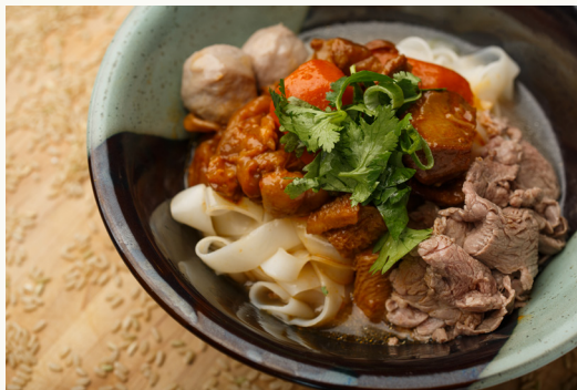
TRIO OF BEEF