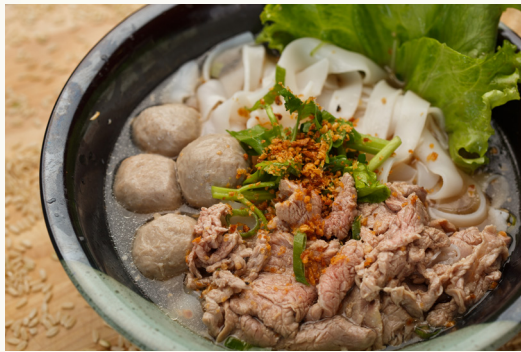
DUO OF BEEF