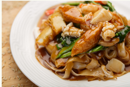
HONG KONG STYLE SEAFOOD CHOW FUN