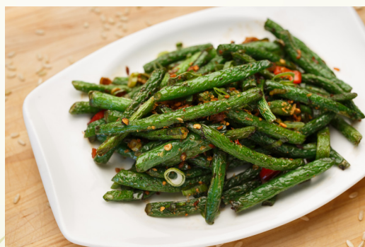
STIR FRIED GREEN BEANS