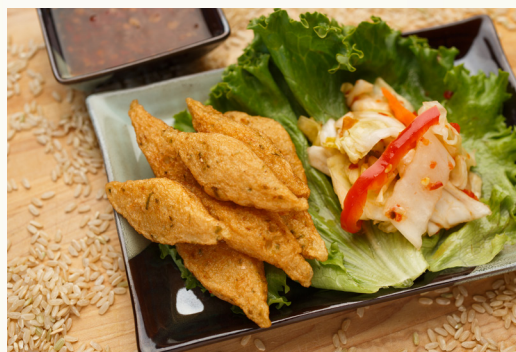
FRIED FISH CAKES